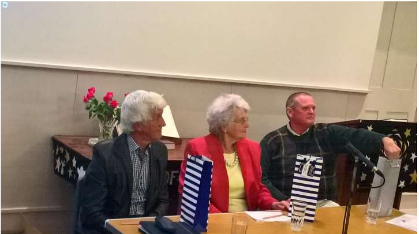
The panel with their Market Bosworth Society pencils.....

. There were some sad moments as we reflected on some no longer with us but we were grateful for the memories they left for us.