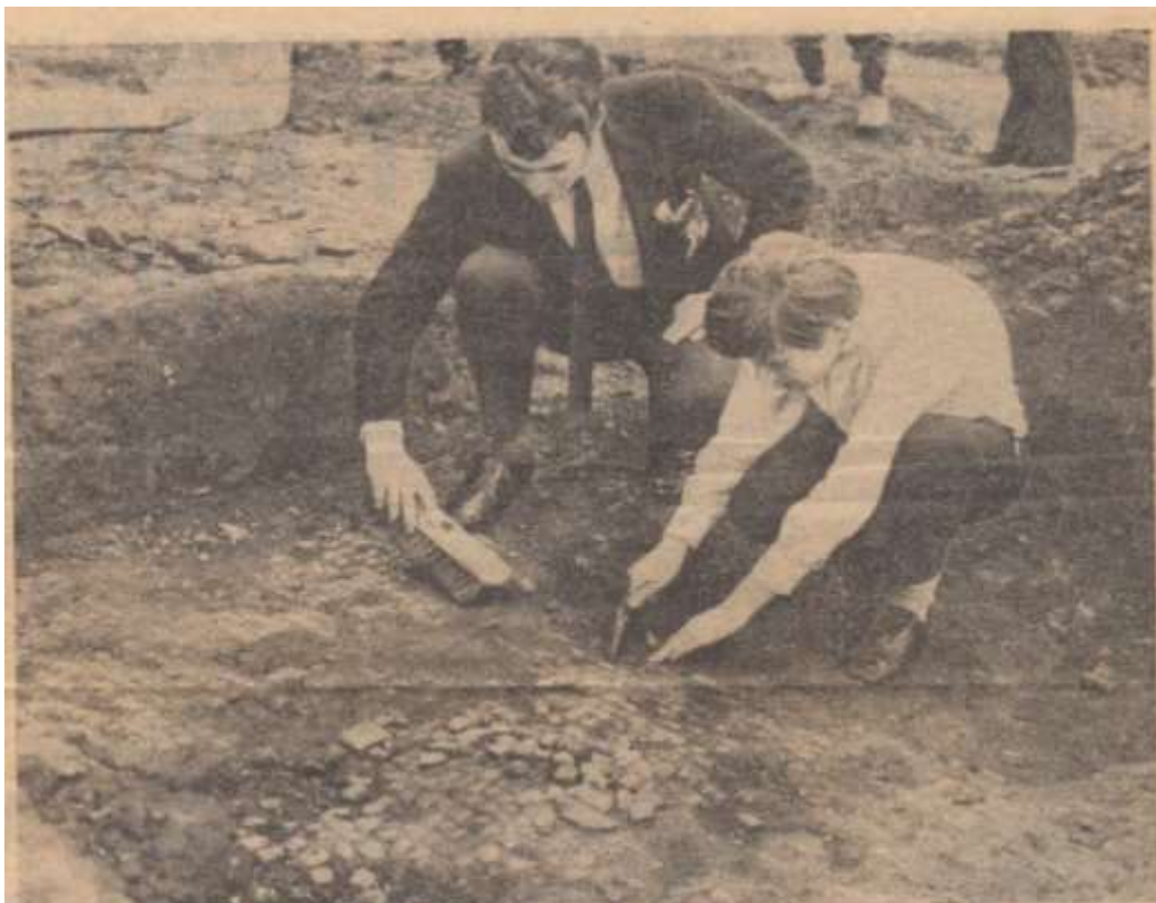
Two members of the Market Bosworth Grammar School Archaeological Society uncovering Roman tiles in the garden of a house in Barton Road, not far from the school.

You will recall I asked about the dig at the Roman Villa site off Barton Road. I have been able to find out