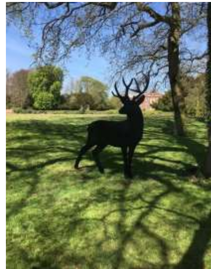
A magnificent beast