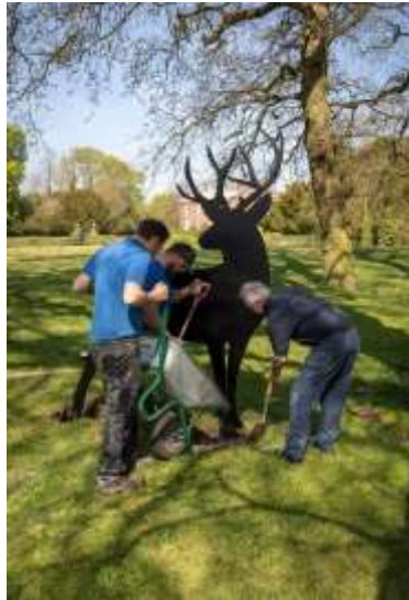
Settling in to his new home