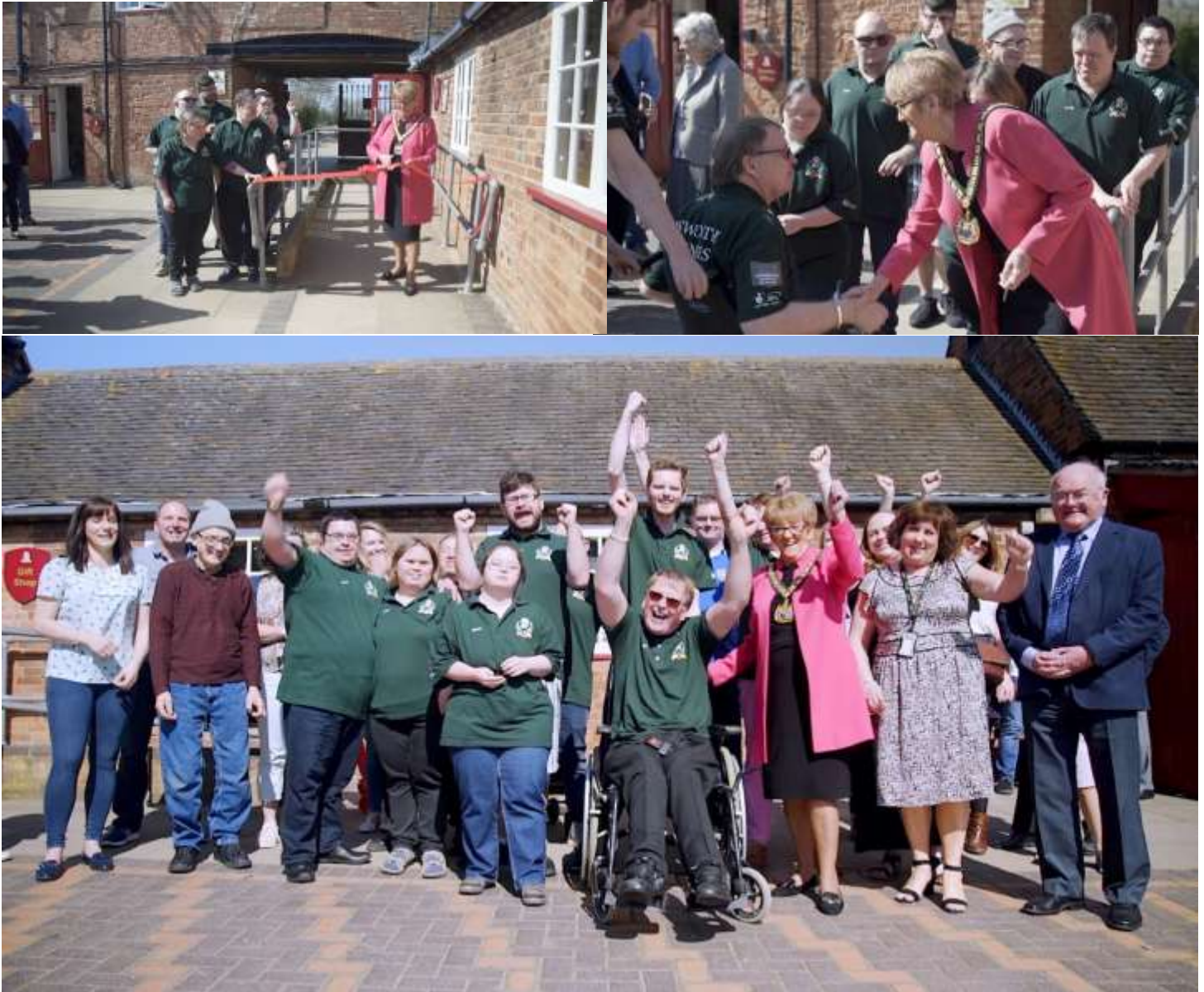
The Tommies.